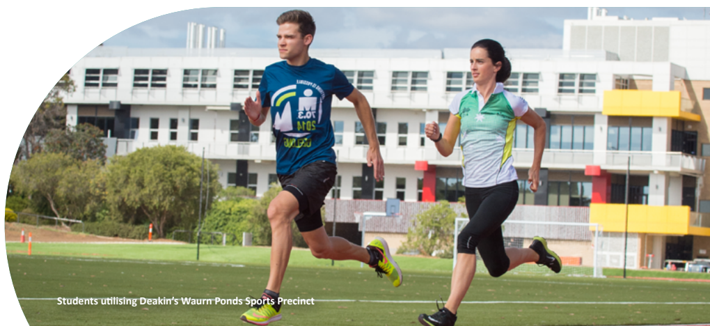
Students utilising Deakin's Waurm Ponds Sports Precinct

We maintain close links with the education sector to ensure our courses are developed and reviewed with industry and professional input. You'll be taught by teaching staff with industry experience, recognised as leaders and innovators in their fields – so you can be confident that what you learn at Deakin will be relevant to your teaching career.