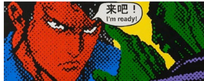
Song Ling, Kong Fu - Our dream 1 2007 acrylic on canvas. Purchase, 2008. Deakin University Art Collection image © copyright and courtesy of the artist and Niagara Galleries, Melbourne (Face to Face Revisited exhibition)