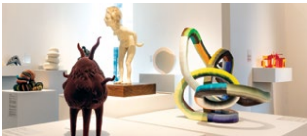
Installation image of the 2024 Deakin University Contemporary Small Sculpture Award, 2024, photography Fiona Hamilton. image © copyright and courtesy of the artists