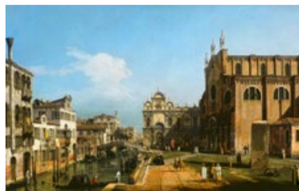
Bernardo Bellotto, The Campo di SS. Giovanni e Paolo, Venice, 1743/1747 , oil on canvas. Promotional image only provided by Curators of the Venetian Bind exhibition. Image in the public domain, Courtesy National Gallery of Art, Washington (Venetian Bind exhibition)