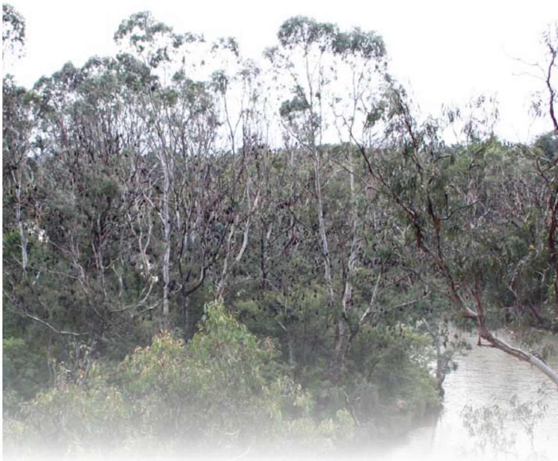
Yarra Bend Park

A further consideration to be taken into account when assessing the contribution of public land relates to conflict between the various liveability goals. For example, selling public land may generate an economic benefit but may decrease opportunities for physical activity. Transport is perhaps the greatest example of where a tension between goals exists – public land delivers roads as well as environments for remediating the impact of car emissions on the environment.