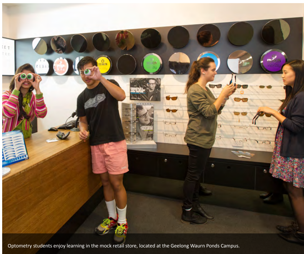
Optometry students enjoy learning in the mock retail store, located at the Geelong Waurun Ponds Campus.

You can learn more about Deakin's optometry courses by visiting deakin.edu.au/study-at-deakin/find-a-course/optometry .